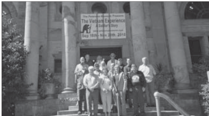
The Vietnam focus group poses under the exhibit banner outside the Museum.