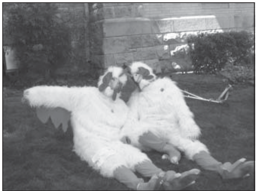
Like our 1925 Egg truck, two Leghorn hens also broke down next to the Museum during the Butter and Egg Days parade!