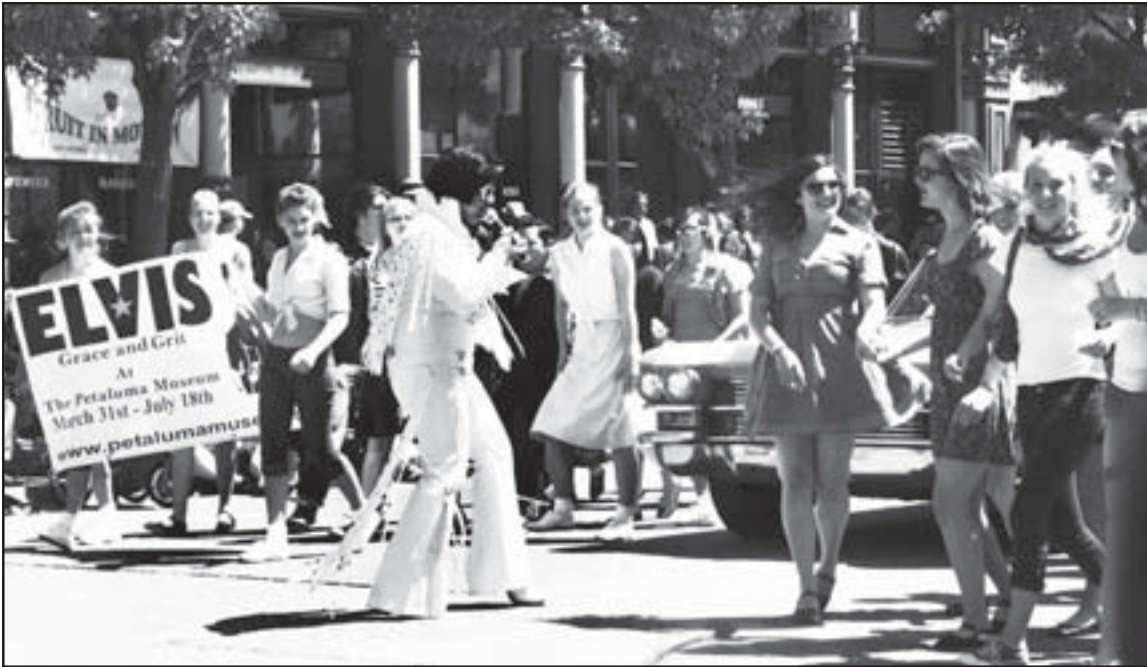
Elvis and fans dance and sing their way along the Butter & Egg Days parade route!