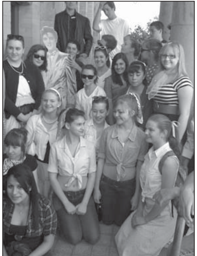
History students from Petaluma High, who “rushed” Elvis as he passed the Petaluma Museum on the parade route.